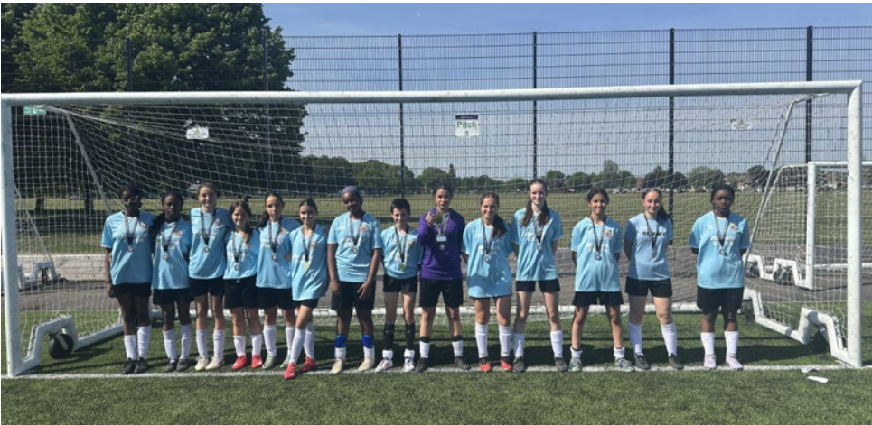
London Cup winners 2025.