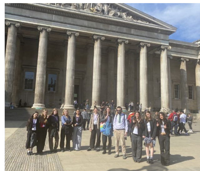
The British Museum – no better place to be for a classics class!

In April, Year 12 Latin and Classics students visited The British Museum to learn more about classical history, art and architecture. They enjoyed a guided tour of the Greek and Roman galleries, putting artefacts and artwork in context as they learned about the key turning points and characters of Greek and Roman history. ■