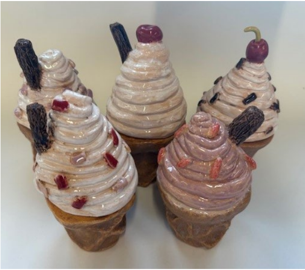
Year 8 clay models