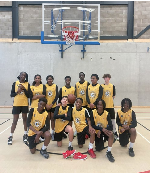
The Year 8 Co-Ed Basketball Team

The Year 7 Girls’ team has had an unbelievable season. Many had never played basketball before, but they proved themselves hugely talented and advanced to the quarterfinals of the Jr-NBA. These girls were also able to go undefeated against their Hackney rivals, winning all their games against other Hackney schools.