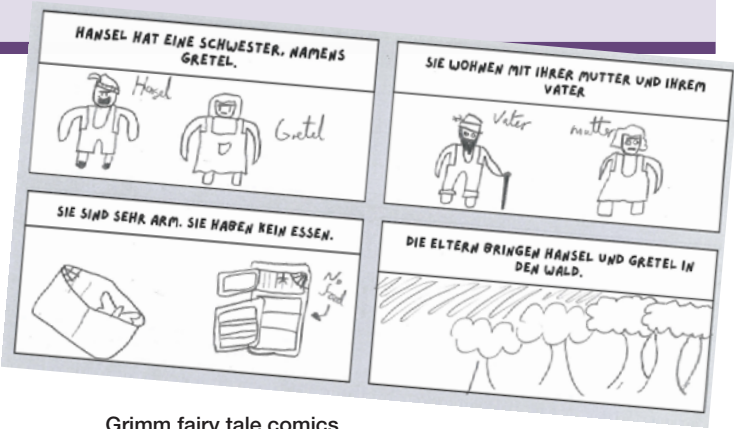
Grimm fairy tale comics