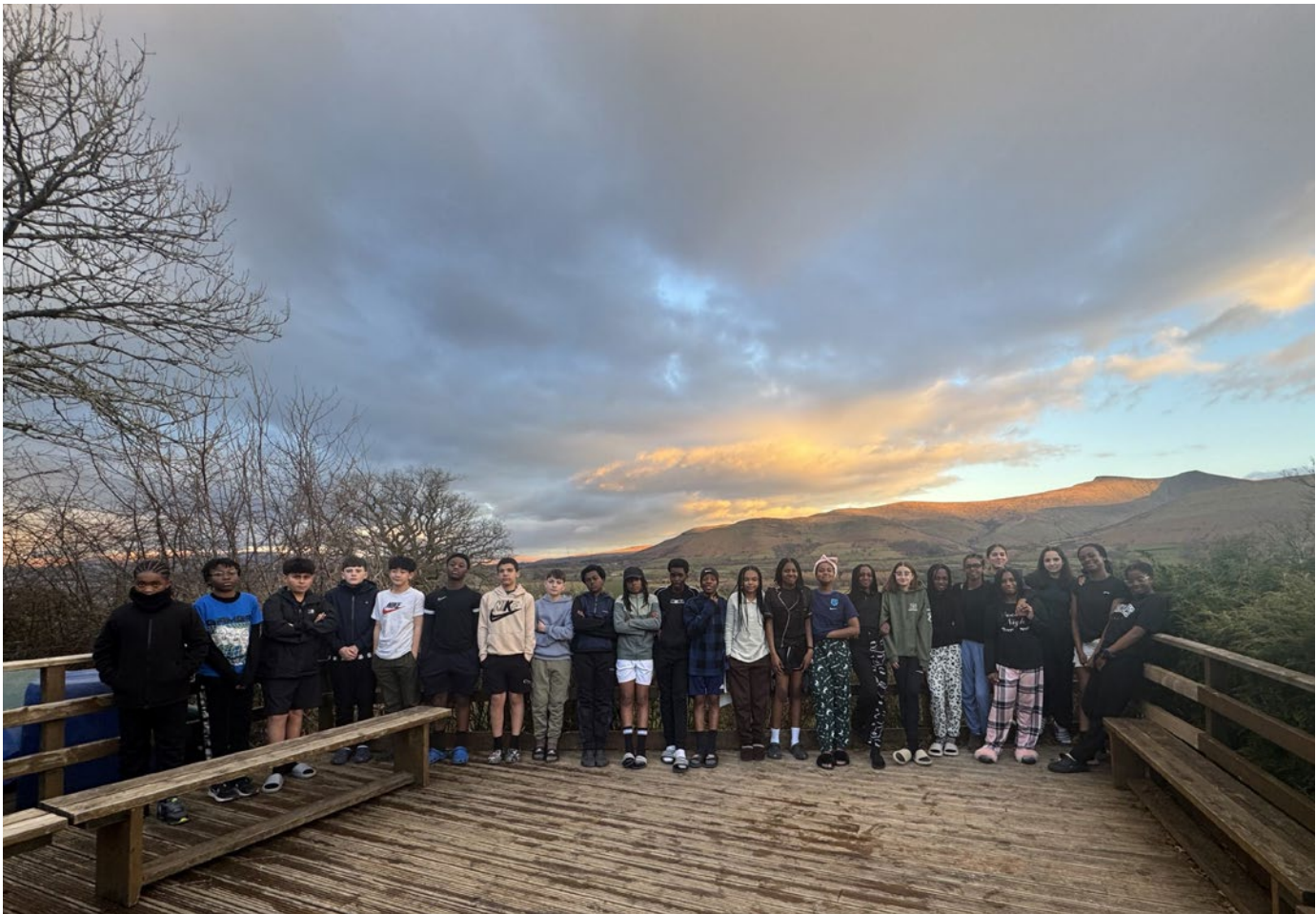
Year 8 students enjoying the Welsh countryside during their spring residential (see article on page 13).

This academic year has been remarkable in terms of the depth of support shown by parents and carers in the face of external challenges; please know that your well wishes mean a huge amount to staff and serve as a timely reminder of the importance of continuing to place children front and centre of every decision we make, and every action we take.