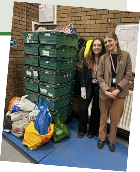
Students from across year groups supported with the Christmas donation to Hackney Foodbank.