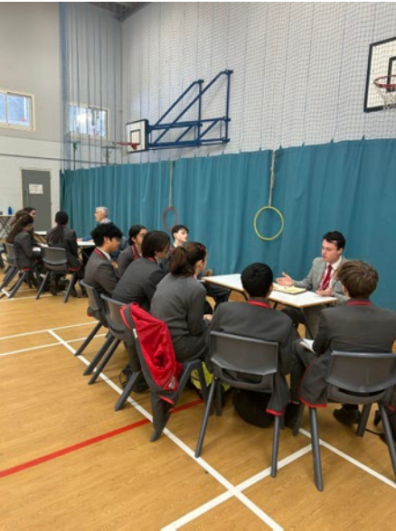
Year 10s considering their futures at the annual careers carousel.

In March, we held our annual careers carousel for Year 10. Students had the opportunity to speak to professionals from a range of different industries, including finance, insurance, veterinary science, the NHS, sports and TV advertising. We are hugely grateful for the time that the attendees gave up to spend with our students, showcasing the various pathways open to them in the future. ■