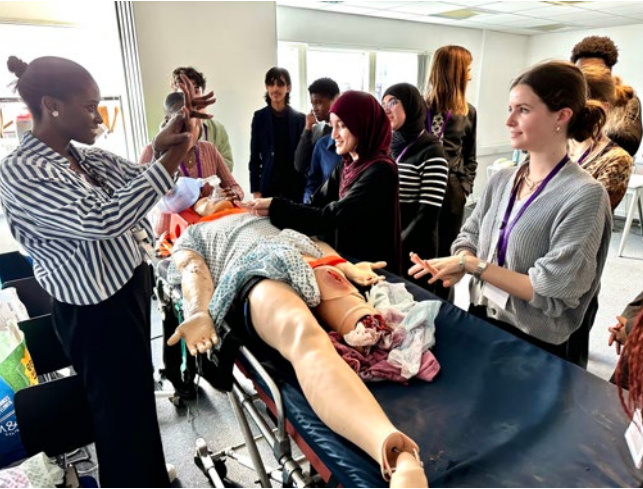
Medical scenario and circuit training at St Mary’s Hospital.