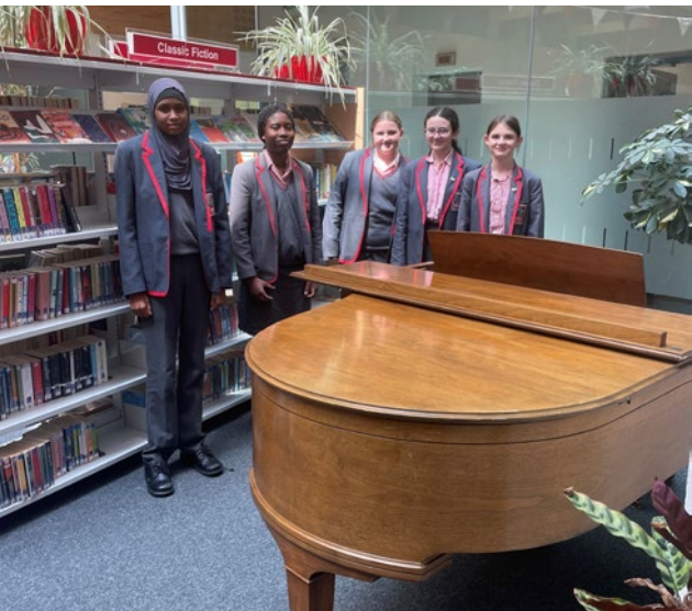
Students admiring the piano which takes pride of place in the library.

We are incredibly excited about the positive impact this noteworthy gift will have on the musical journeys that lie ahead for MCA students. ■