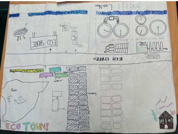
Ecotown – the winning idea for a sustainable town of the future.

In May, the Sixth Form Higher Education Team organised our annual Year 12 Lecture Day. With visiting lecturers from a range of fantastic institutions including Queen Mary University, University of Cambridge, and London School of Hygiene and Tropical Medicine, the day was a great success. All Year 12 students attended three lectures on topics ranging from 'Machiavellian Moments in History' and 'Cyber Wars: Behind the Screens and Inside the Cyber Threat Landscape' to 'The Subtle Art of the Octave: Piano Tuning for Maniacs'. ■