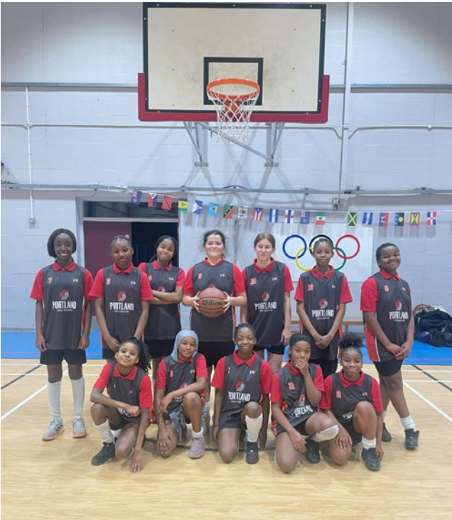
The Year 7 Girls' Basketball Team

The Year 8 Co-Ed team, last year’s Jr-NBA bronze medallists, progressed to the quarterfinals of this year’s competition. We’ve enjoyed some outstanding matches this year, with special highlight being our win against City Academy (last year’s gold medallists).