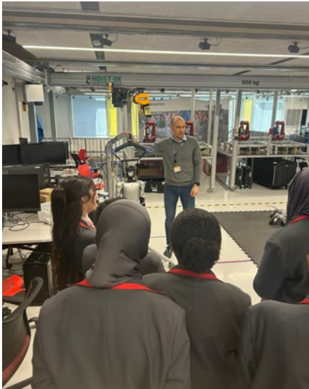
Our students on a tour of the robotics lab at UCL East.

In April, a group of Year 8 students attended the Rae Harbird Day at UCL East. This event aims to introduce students to computer science and coding. We were also fortunate enough to receive a tour of the robotics lab to see the new robots that the department at UCL are developing. At the end of the day, students were tasked with solving a series of coding and mathematical puzzles in a virtual escape room. ■